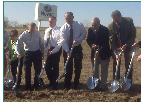
Gov. Mitch Daniels along with officials from Novae and Wabash “break ground” at the new North Manchester location.

Gov. Mitch Daniels was on hand to welcome Novae Corp. of Markle, Ind., to its new facility in North Manchester. The Sure-Trac Trailer Division of Novae, “one of the fastest growing privately held companies in the U.S.,” recently purchased the former Dexter Axle building on State Road 114 east of North Manchester and currently employs approximately 80 workers. Novae invested $2.1 million in the new venture. In addition to buying the 88,000-square-foot facility at 11870N 650E and the 73 acres it sits on, Novae will spend $818,500 on building improvements, $236,000 on new equipment and $75,000 for its own wastewater treatment plant. The average salary at the Novae plant will be $15.60 per hour plus benefits.