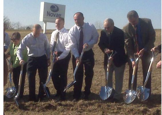
Gov. Mitch Daniels along with officials from Novae and Wabash “break ground” at the new North Manchester location.