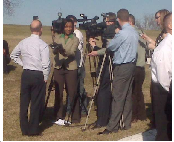
Gov. Mitch Daniels being interviewed by the media after the announcement and groundbreaking.