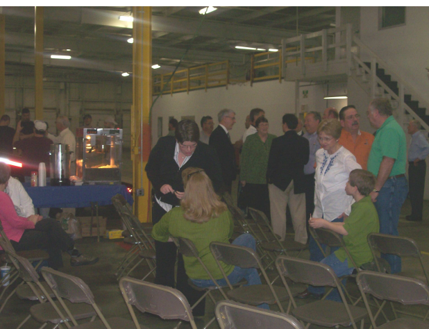
A crowd gathered at a Novae Corp. event, waiting for the announcement.