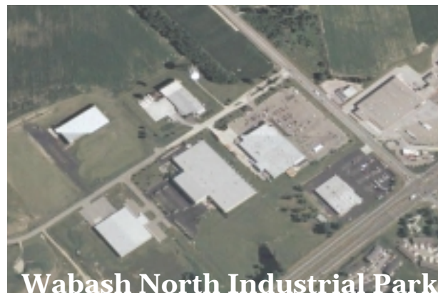
Wabash North Industrial Park

Members of both boards discussed the positive and negative aspects of giving EDG control of the property. One of the most positive aspects of granting EDG control over the land is the speed at which business transactions can be completed. A normal transaction through the City can take 90 days or more due to the need for approval of multiple boards. If control is vested with EDG the only board that would need to approve the transaction is the EDG board. This will substantially reduce the transaction time and permit us to operate at the speed of business. The City will continue to be involved in the approval processes as it has sole discretion over issues of zoning, tax abatement and other incentives.