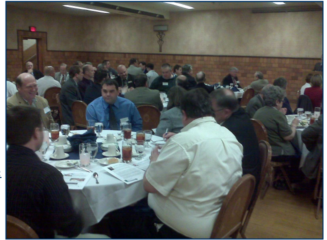
A crowd of approximately 90 attend the EDG's 2010 Annual Meeting.